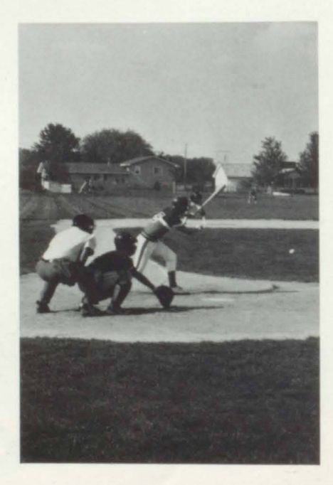
... It's a hit!!